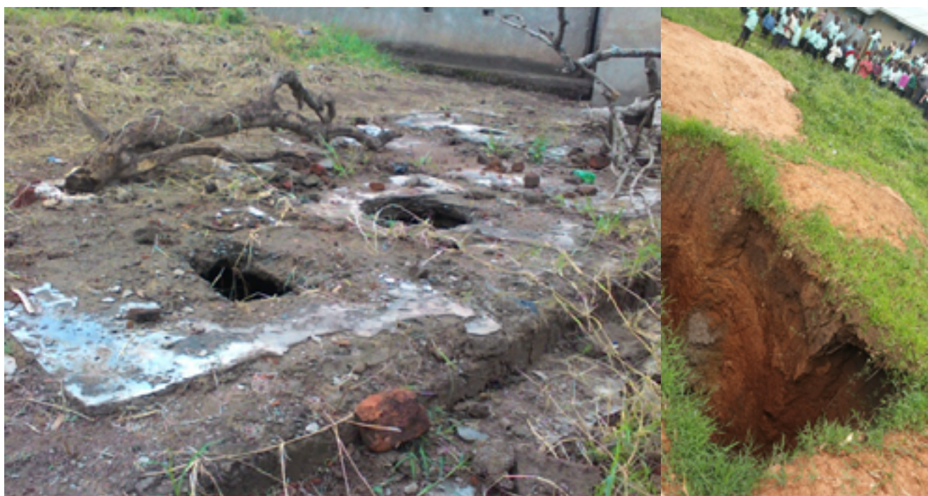
Figure 4. collapsed latrine at St. John's Nsongya Primary School in Uganda and collapsing soils in Kinoni Primary School in Uganda

After progressively initiating the WASH & Learn Programme WASH projects (constructing toilets and a water tank), the stakeholders (TDFT, School Management, Teachers and Parents) in Kizigo Primary School have sought support from the Chinese road construction company which helped them buy a wire to boost their capacity to pump water into the school tank. The school also has put up projects including a poultry project they estimate should be able to bring in an income of 900,000Tshs monthly as well as a tree seedling project (selling each seedling at 1,000Tshs) to bring in 1,000,000Tshs. Once realised these funds are to be channelled into operation and maintenance, The school currently hires two security guards to prevent vandalism.