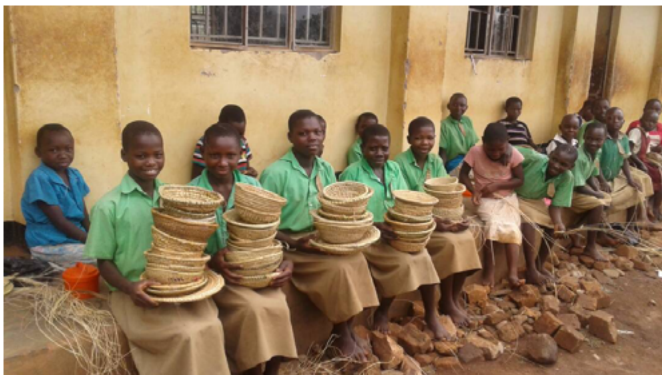
Figure 5: Pupils showing crafts to sell as income generating activity at Kyamunjundo Primary School (Kakumiro District, Uganda)

The tool is administered at school level at the inception stage as a measure of stock taking the current status of the school in terms of pupil and teacher population, WASH infrastructure and opportunities for cost recovery projects. Table 2 and 3 below demonstrate how the tool aids the school to plan and solve operation and maintenance challenges.