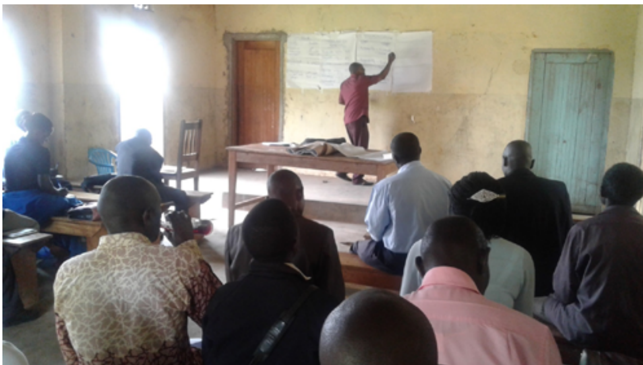
Figure 3. Parents and teachers are discussing the risk assessment at Birembo Primary School in Uganda

Common risks identified among the schools in the WASH & Learn Programme include vandalism, lack of operation and maintenance funds, mismanagement of WASH facilities by pupils and public, lack of ready supply chain of spare parts and lack of toilet emptying services. These risks often indicate limited commitment on the part of the stakeholders in ensuring the sustainability of the project and once identified are best mitigated by the stakeholders who agree on rules to govern the management of the WASH facilities and maintenance strategies.