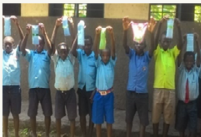
Figure 6: Boys participating in the RUMPs training and showcasing their works