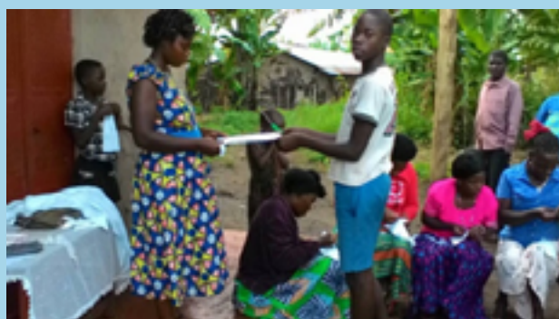
Figure 7: 12-year-old Lumas facilitating a Reusable Menstrual Pads training of a women's group in his village