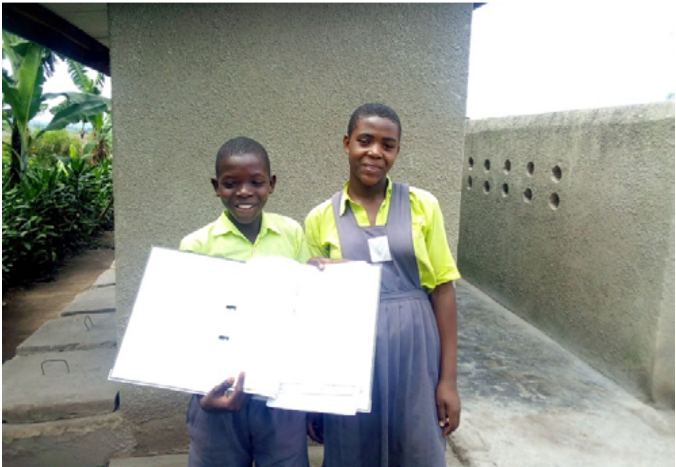
Figure 3. SHC leaders at St. John Nsongya Primary School show off their records.