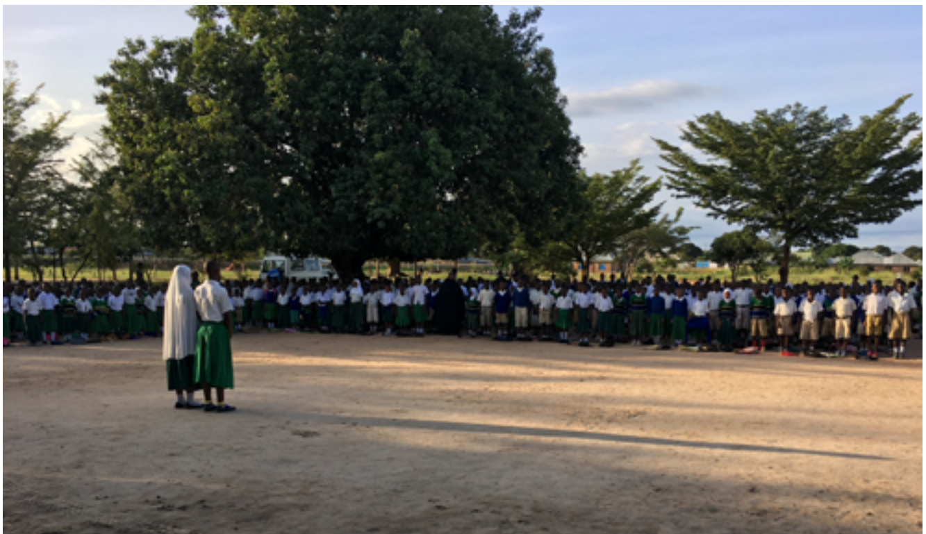
Figure 1. School Health Club engagement at Kizigo Primary School in Tanzania

Kitere Primary School in Uganda is one of the schools where the WASH & Learn Programme partner HEWASA implements. The school has an active School Health Club where the pupils taking lead in advocating for WASH. At the school, pupils plan WASH related activities including ensuring safe water consumption, handwashing, proper waste management, counseling on personal and menstrual hygiene as well as environmental beautification, gardening and community outreaches supported by a senior female and senior male teacher. The pupils also conduct mentoring sessions for pupils in the school. This has led to improved hygiene practices in the school with more pupils observing personal and environmental hygiene as well as safe water drinking. Also partly due to the efforts of the school health clubs there was an increase in latrine coverage based on the findings from the VHTs and the Sub county Health office.